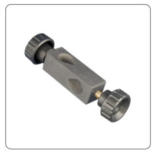
Boss head clamp