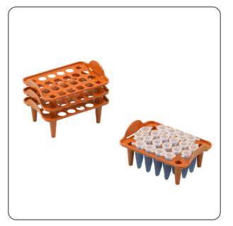
AccuRack tube racks