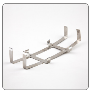
Rack holder for 15 mL tubes