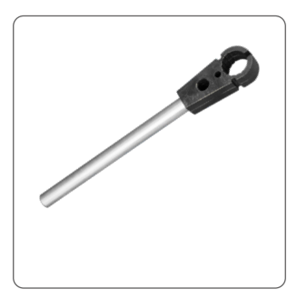
Temperature probe holding rod