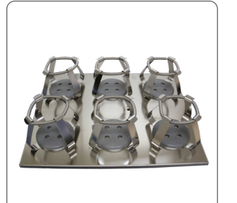
Platform with 6 x 1L flask clamps