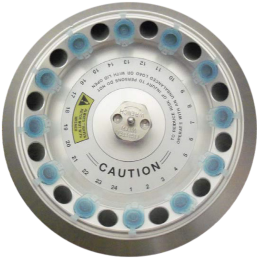
Figure 1. Loading the rotor to achieve balance.

Tubes to be loaded should be filled equally by eye. The difference in the weight between the tubes should not exceed 0.1 gram. Tubes should always be loaded so that there is equal spacing between all tubes. One or two additional loaded tubes may need to be added to achieve this. One typical balancing scheme is shown in Figure 1.