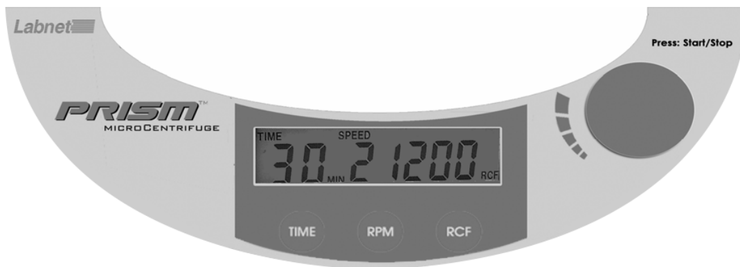
Figure 2. Labnet Prism™ microcentrifuge control panel layout.

The speed (rpm or g-force) can be selected from 500 to 15,000 rpm in 100 rpm increments or from 100 to 21,200 x g with the control knob. The speed is selected by pressing the RPM or RCF button. The speed signal will begin to blink. Then, turn the control knob to increase or decrease the value.