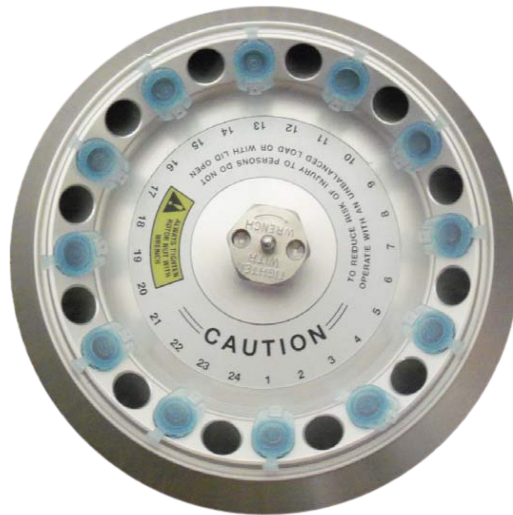
Figure 1. Loading the rotor to achieve balance.

The Labnet Prism™ microcentrifuge comes complete with a standard 24-place rotor installed. To remove the rotor for cleaning, using the rotor wrench remove the rotor securing screw from the motor shaft by turning the screw counterclockwise. Lift the rotor directly upward in a straight vertical motion.